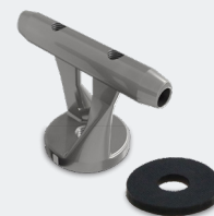
SAFETYPRO WIRE ANCHOR HEAD SET