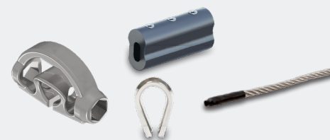
SAFETYPRO FIX ACCESSORIES