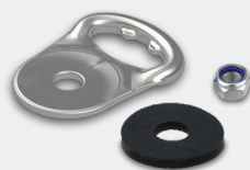
SAFETYPRO ANCHOR POINT HEAD AND CONNECTOR SET