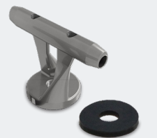
SAFETYPRO WIRE ANCHOR HEAD SET