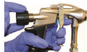
Black valve to adjust bead width