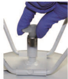
Leave the valve open