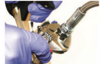
Braided-hose and gun-applicator