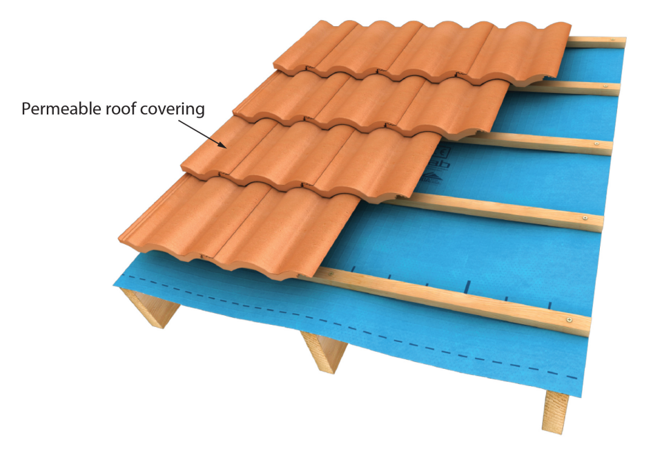
Figure 1: Cold Roof detail with permeable roof covering