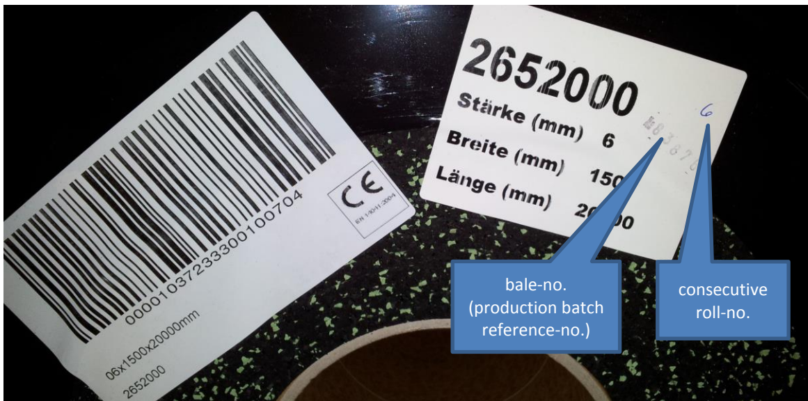
Figure 5: Lettering of the rolls with roll- and bale number (product batch reference number)

In case of claims caused of falsely delivered goods, defect goods, insufficient quantities or other possible faults make a claim immediately and stop the installation directly. A claim of delivered material is only possible with untreated material and with declaration of the production batch reference number (Fig. 5).