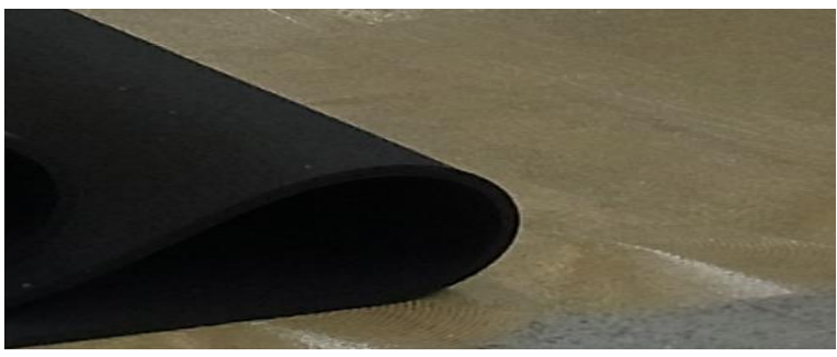
Figure 2: Installation and alignment of the SPORTEC® product