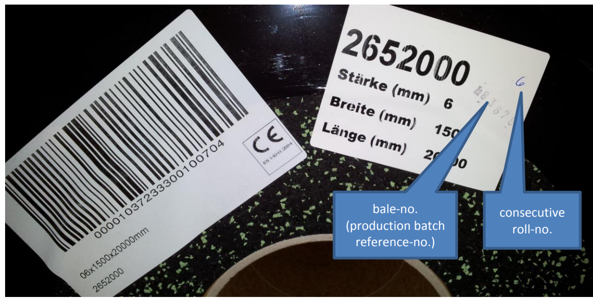
Figure 5: Lettering of the rolls with roll- and bale number (product batch reference number)

Figure 4: Pay attention to the production batch reference, placed with labels on the rolls