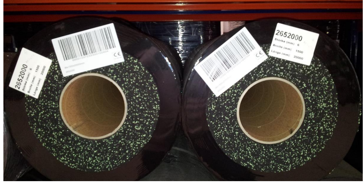
Figure 4: Pay attention to the production batch reference, placed with labels on the rolls

Installation Recommendations no. 9122 - R - 03 Issue: February 2014