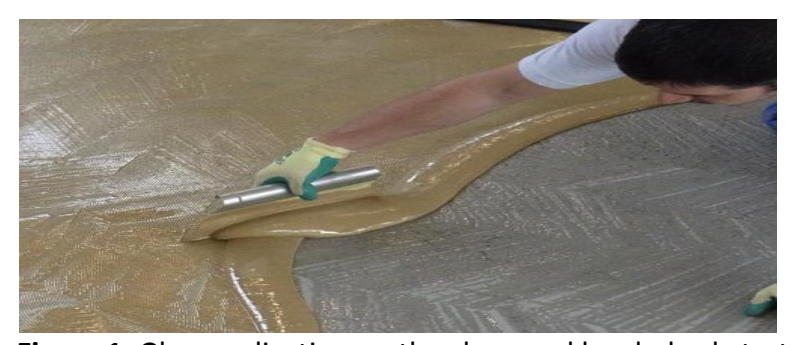
Figure 1: Glue application on the clean and leveled substrate

The same applies when using a sealing material for the surface of the installed floor covering. Before apply a sealing material ensure that the floor covering to be sealed is clean and free of any other pollution. When necessary clean the area before sealing it. Do not trespass the sealed floor before the sealing material is completely hardened.