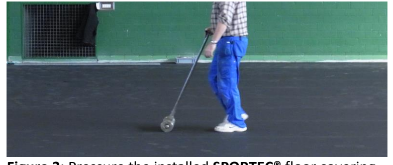
Figure 3: Pressure the installed SPORTEC® floor covering

The installation recommendation is not subject to any change service! All information is without guarantee. Latest version of this document available on <a href="https://www.kraiburg-relastec.com/sportec">www.kraiburg-relastec.com/sportec</a>