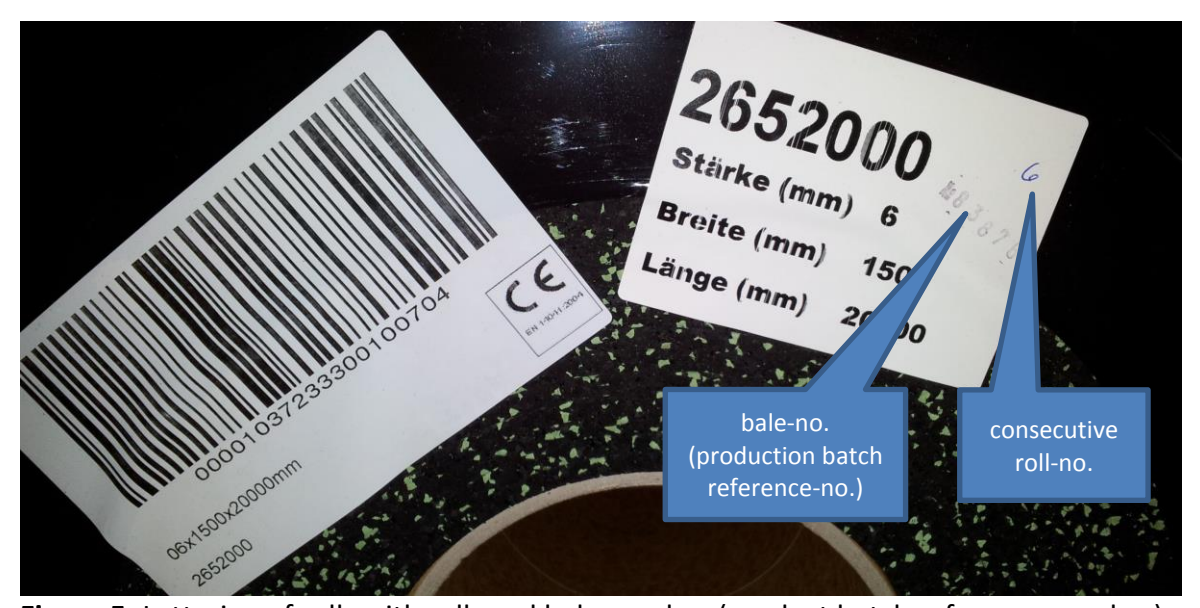
Figure 5: Lettering of rolls with roll- and bale number (product batch reference number)

In case of claims caused of falsely delivered goods, defect goods, insufficient quantities or other possible faults make a claim immediately and stop the installation directly. A claim of delivered material is only possible with untreated material and with declaration of the production batch reference number (Fig. 5).