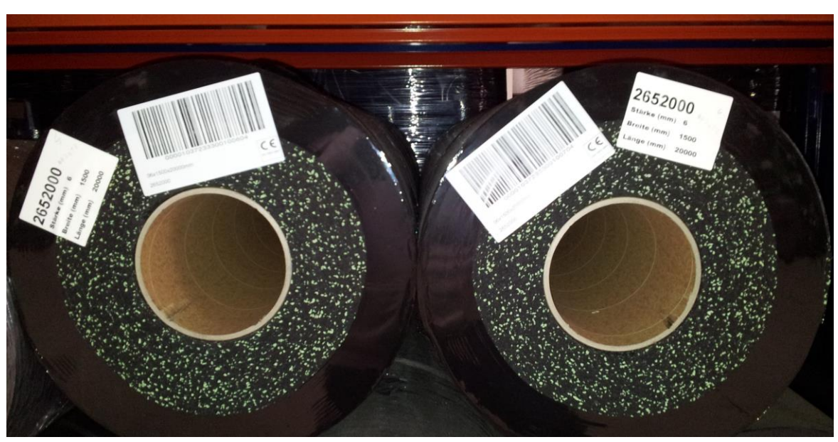
Figure 4: Pay attention to the production batch reference, placed with labels on the rolls