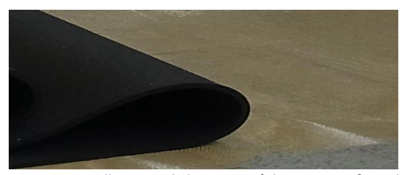
Figure 2: Installation and alignment of the SPORTEC® product