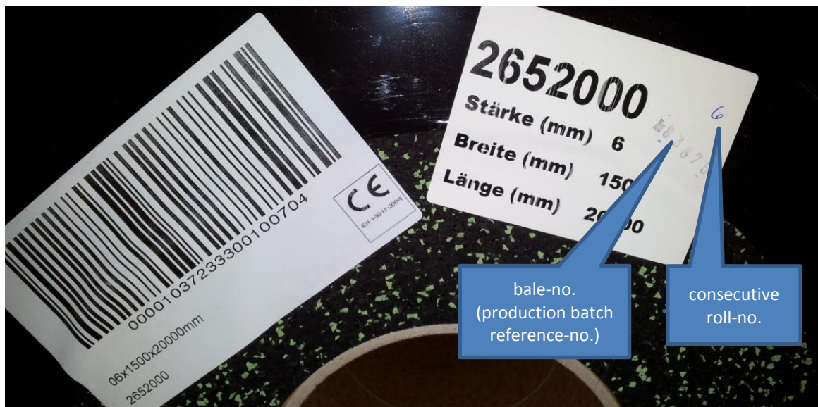
Figure 5: Lettering of rolls with roll- and bale number (product batch reference number)

In case of claims caused of falsely delivered goods, defect goods, insufficient quantities or other possible faults make a claim immediately and stop the installation directly. A claim of delivered material is only possible with untreated material and with declaration of the production batch reference number (Fig. 5).