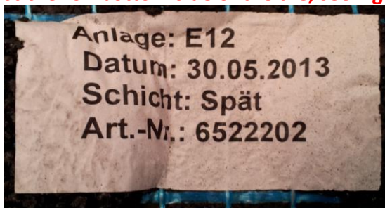
Figure 3: production reference batch

A claim of delivered material is only possible with untreated material and with declaration of the order number or production batch reference number. This number is printed on a sticker on bottom side of the tile, see Figure 3.