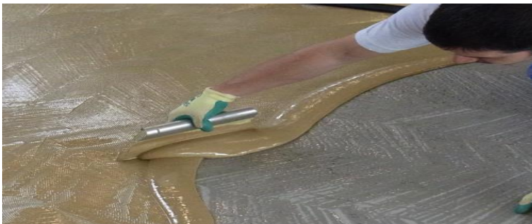
Figure 1: Glue application on the clean and leveled substrate

The same applies when using a sealing material for the surface of the installed floor covering. Before apply a sealing material ensure that the floor covering to be sealed is clean and free of any other pollution. When necessary clean the area before sealing it. Do not trespass the sealed floor before the sealing material is completely hardened.