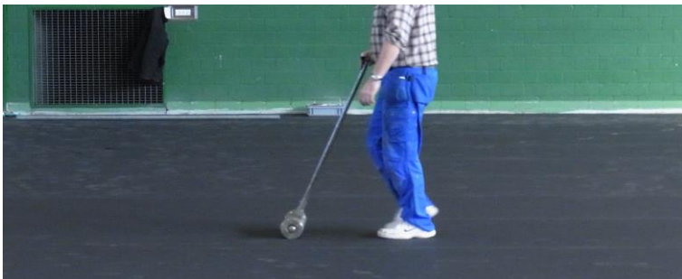
Figure 3: Pressure the installed SPORTEC® floor covering

The installation recommendation is not subject to any change service! All information is without guarantee. Latest version of this document available on www.kraiburg-relastec.com/sportec