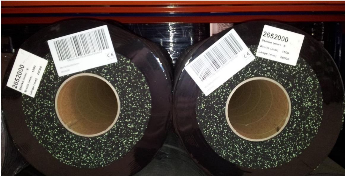
Figure 4: Pay attention to the production batch reference, placed with labels on the rolls