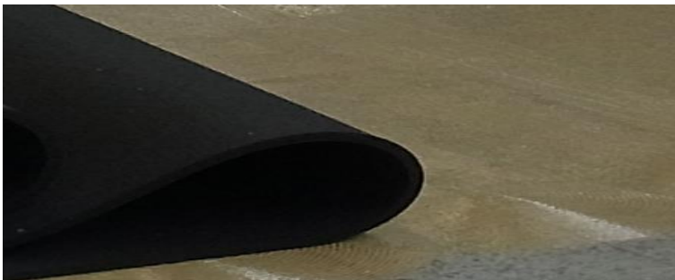
Figure 2: Installation and alignment of the SPORTEC® product