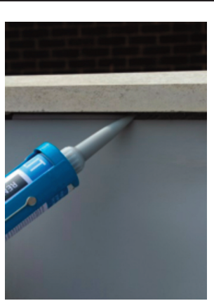
Sealing perimeter upstand