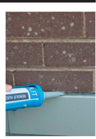
Sealing chased metal edge to RENOLIT ALKORPLAN onto a sacrificial layer

*Please note EPDM materials vary and should be tested for suitability prior to use