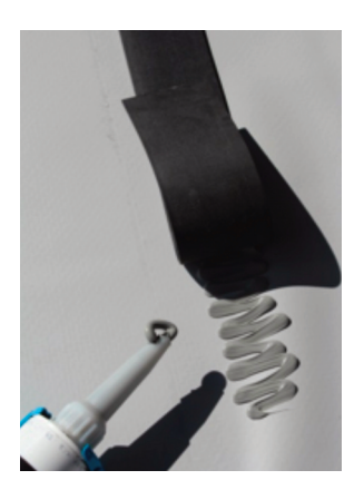
Isolating EPDM weather strips*