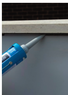
Sealing perimeter upstand