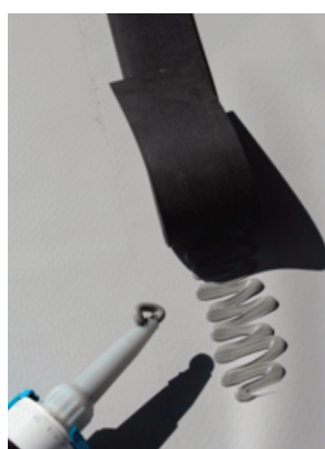
Isolating EPDM weather strips*