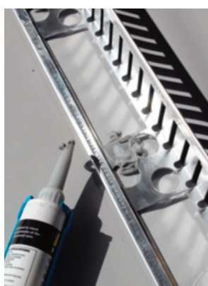
Tacking green roof retention