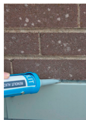
Sealing chased metal edge to RENOLIT ALKORPLAN onto a sacrificial layer

*Please note EPDM materials vary and should be tested for suitability prior to use