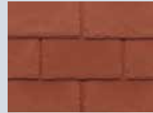
709 Brick Red