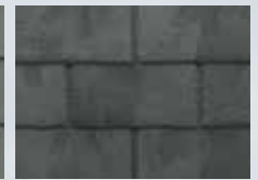
718 Grey/Black Blend