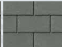
815 Sage Green