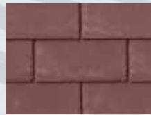
809 Red Rock