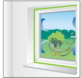
Fig 2 Seals against draughts