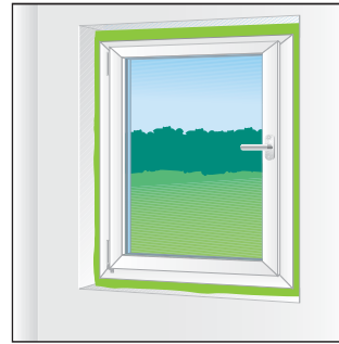
Fig 1 For the perimeter sealing of windows & doors

sales.uk@tremco-illbruck.com www.tremco-illbruck.co.uk